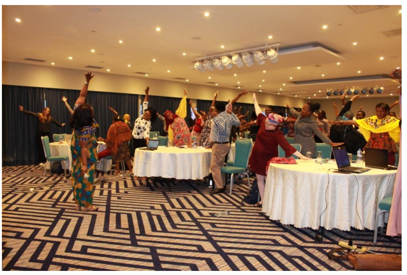
The learning by doing approach was practiced during WHRDs self-care and well being session

Coalition conducted self care and well being session to WHRDs on 20<sup>th</sup> April 2022.The session aimed to reduce incidences of mental health to WHRDs. UN OHCHR-EARO facilitated the Technical support to WHRDs in how to remove work stresses and traumas resulting from defending works.