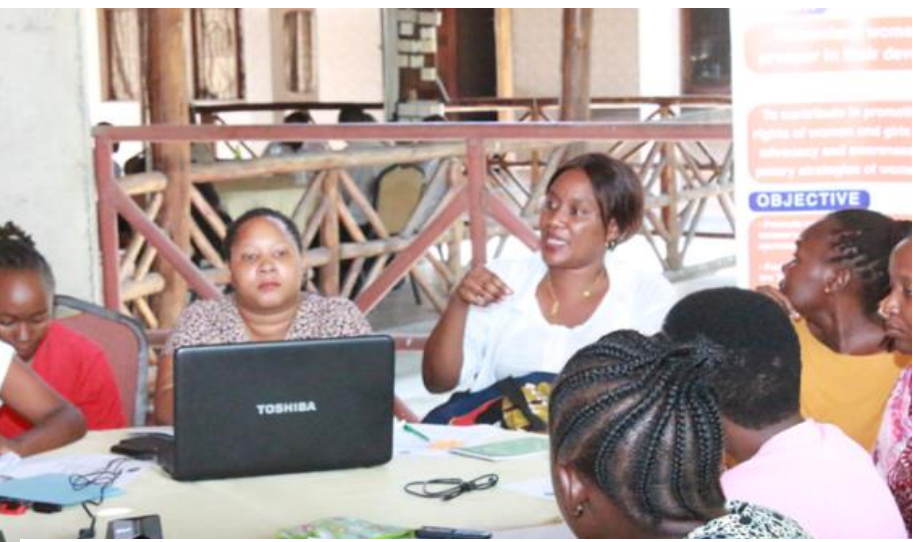
Participants of the discussion dialogue on SRHR and available services of post abortion care for women and girls

The Coalition for Women Human Rights Defenders Tanzania conducted the dialogue discussion on Sexual Reproductive Health and Rights to find out the understanding of the availability of post-abortion care services to women and girls in the country.