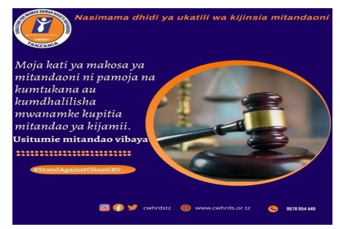
One of the posters carrying different messages against online gender based violence

On March 22, 2022 Coalition launched the second campaign against online GBV themed " NasimamaDhidiyaUkatiliwaKijinsiaMitandaoni" ( I stand against online based GBV ).During the campaign, social media posters with different messages of online Gender Based Violence (GBV) were posted based on femicide, intimate partners' violence and sexual harassment aimed at protecting the rights of women and girls including WHRDs and women in leadership against online gender based violence.