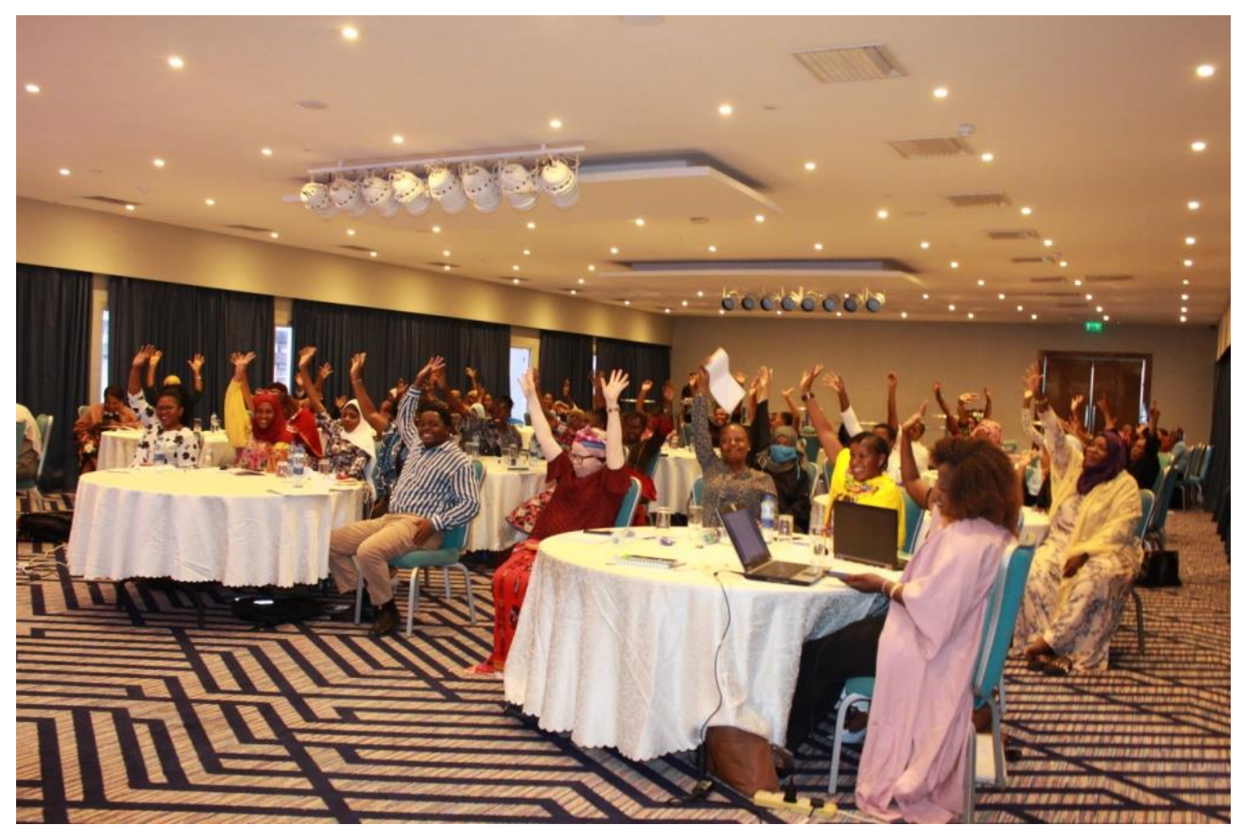
Group photo of participants during the CWHRDs Annual General Meeting

New Board of Directors (6 members) were elected and re-elected to support secretariat on the implementation of its five year Strategic Plan which was launched one day before the day of annual General meeting.