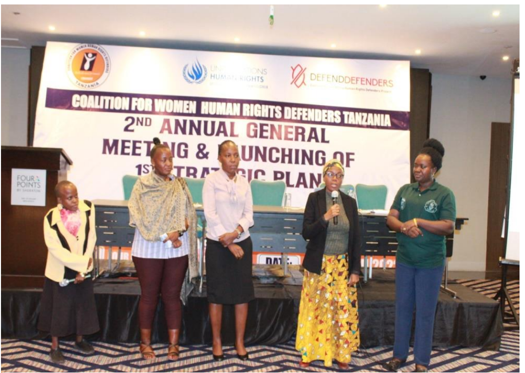
Candidates vying for Board membership ask for votes from Annual General Meeting members

20<sup>th</sup> April 2022 the coalition held its 2<sup>nd</sup> Annual General Meeting with its 68 members of the coalition who gathered from rural and urban areas of Tanzania mainland and Zanzibar. During Annual General meeting members got a chance of discussing annual activity and financial reports. This year also members of the coalition conducted the election of Members of their Board of directors.